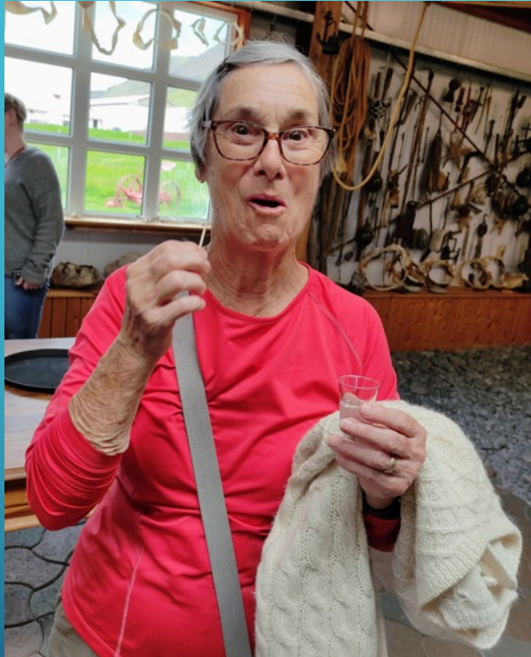
It's in my mouth ...