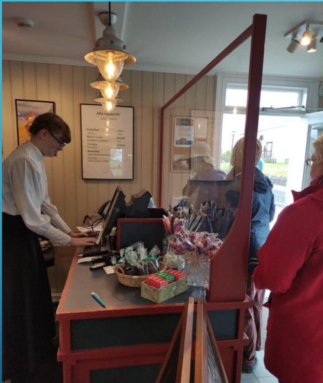
Museum stores are always so interesting ...