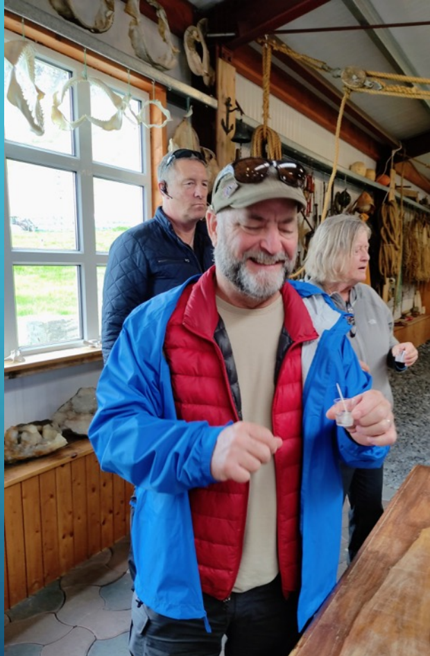
Nothing to it: Shark in the Black Death snaps, then in my mouth ...