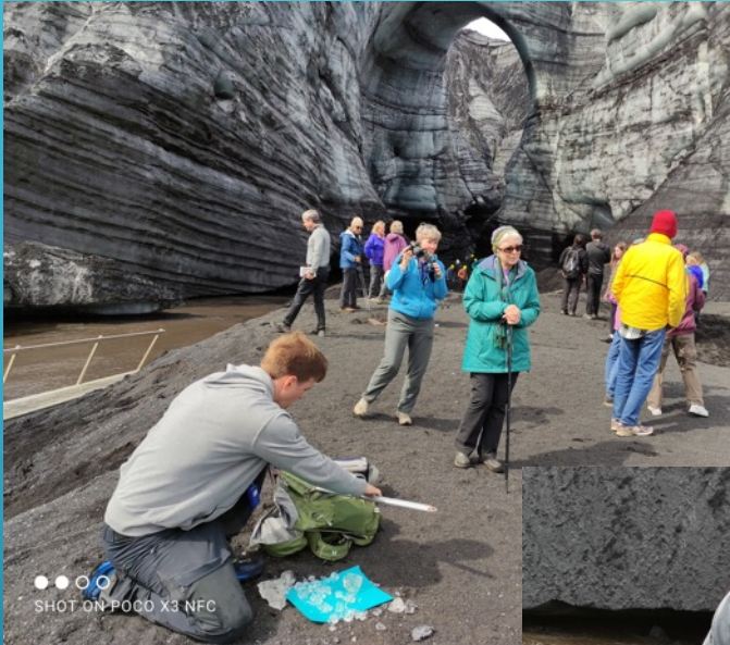
First Ingó broke a piece of ice of Katla jökull glacier. Then broke it into small pieces with ice pick ...