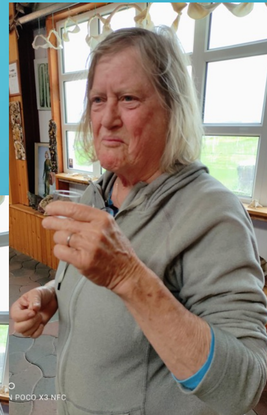
NOW, I understand why Gordon Ramsey spit IT out !!!!