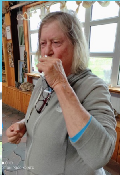
Drink the snaps ...