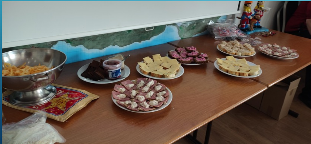
After shopping at the super market lunch was prepared; A Taste of Icelandic Christmas.