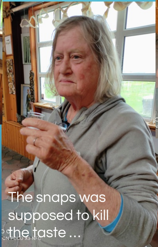
The snaps was supposed to kill the taste ...