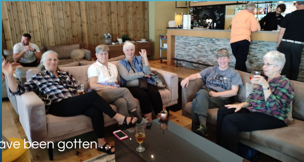
Happy drinks have been gotten ...