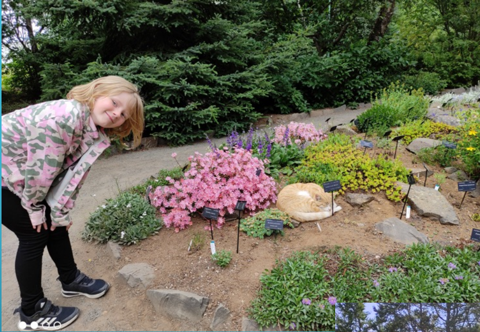
Alexa, Bryndís' grand daughter, by a sleeping cat in the flower bed.