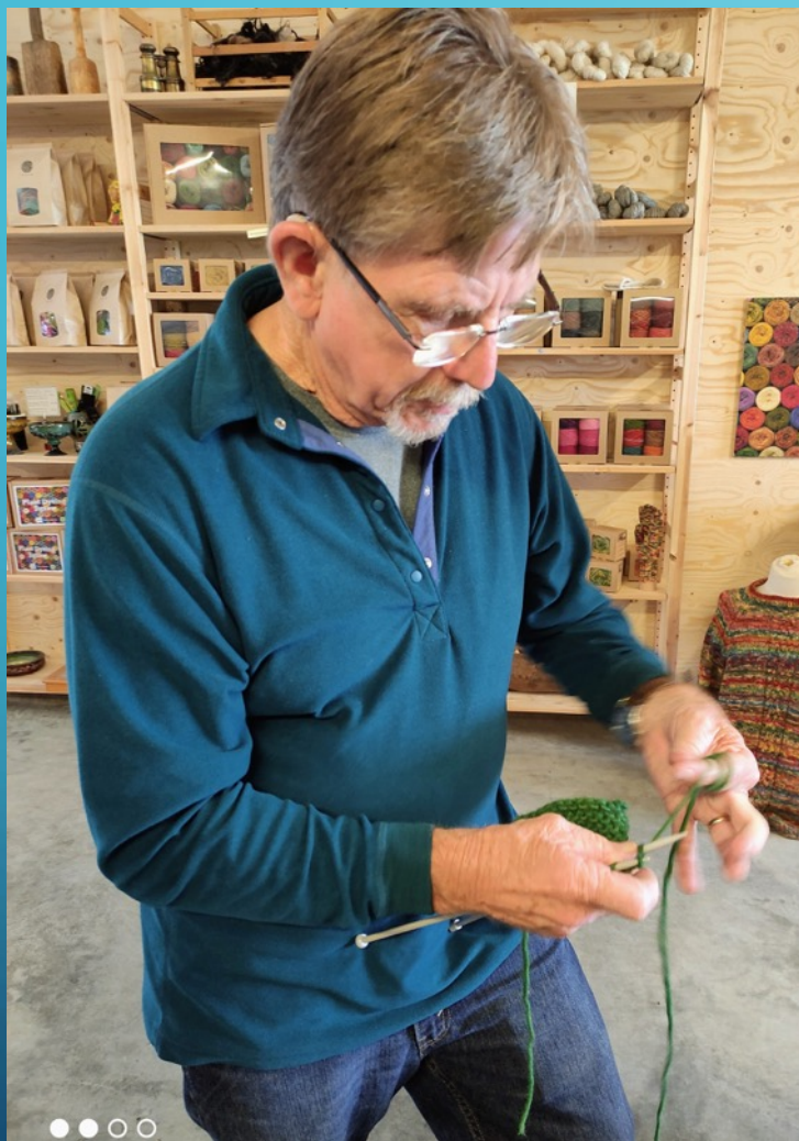
It can't be THAT hard . . .