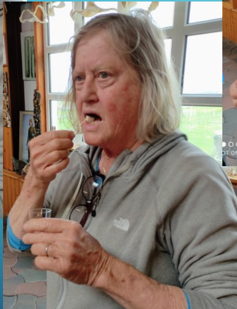
Put IT in your mouth ...