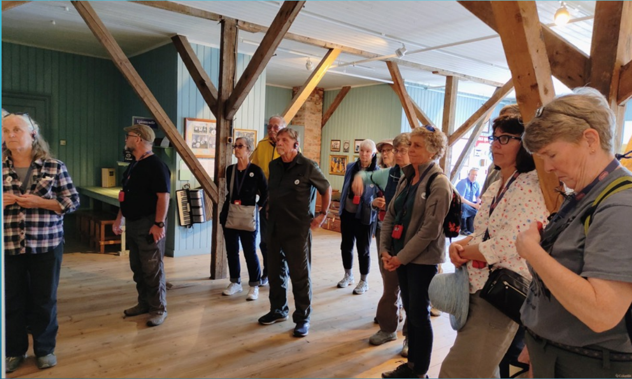
Learning all about the herring era in Iceland.