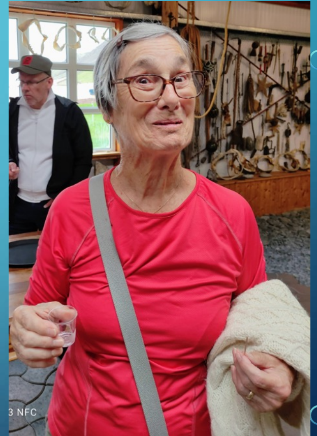
"Now I am going to die ..."