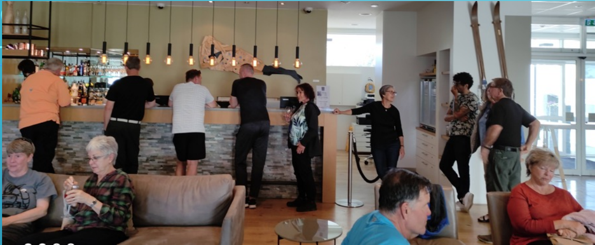
Waiting in the Happy hour line.