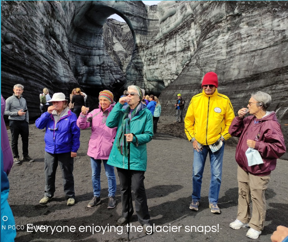
Everyone enjoying the glacier snaps!