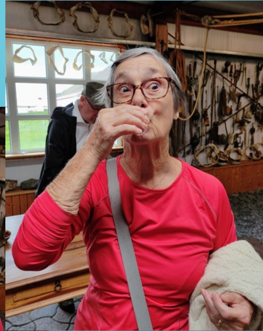
Maybe it will taste better with the snaps ...