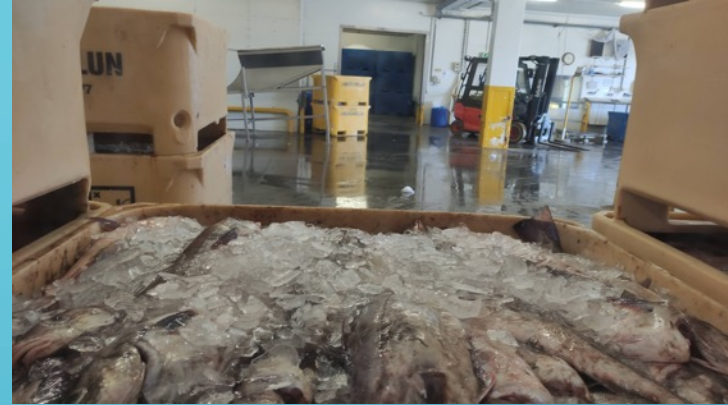
Freshly caught fish at the Fish Market.