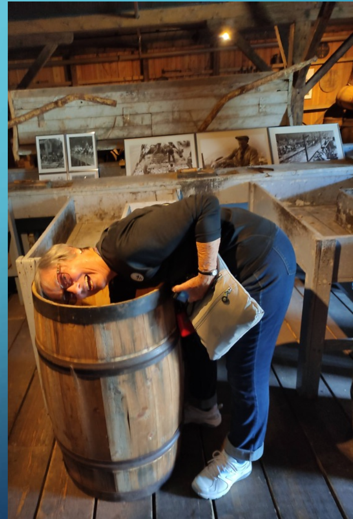
One of the Herring girls got left behind ...