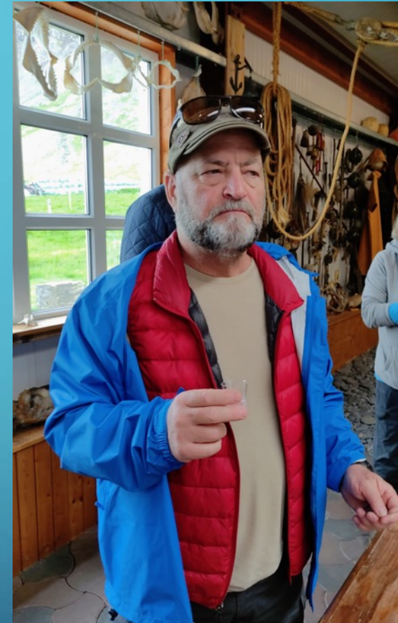
Icelandic Vikings like it, so I will pretend I like it too.