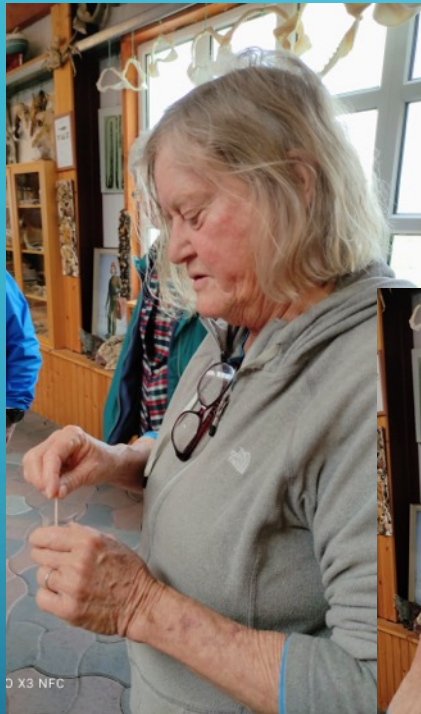
Dip IT in the snaps ...