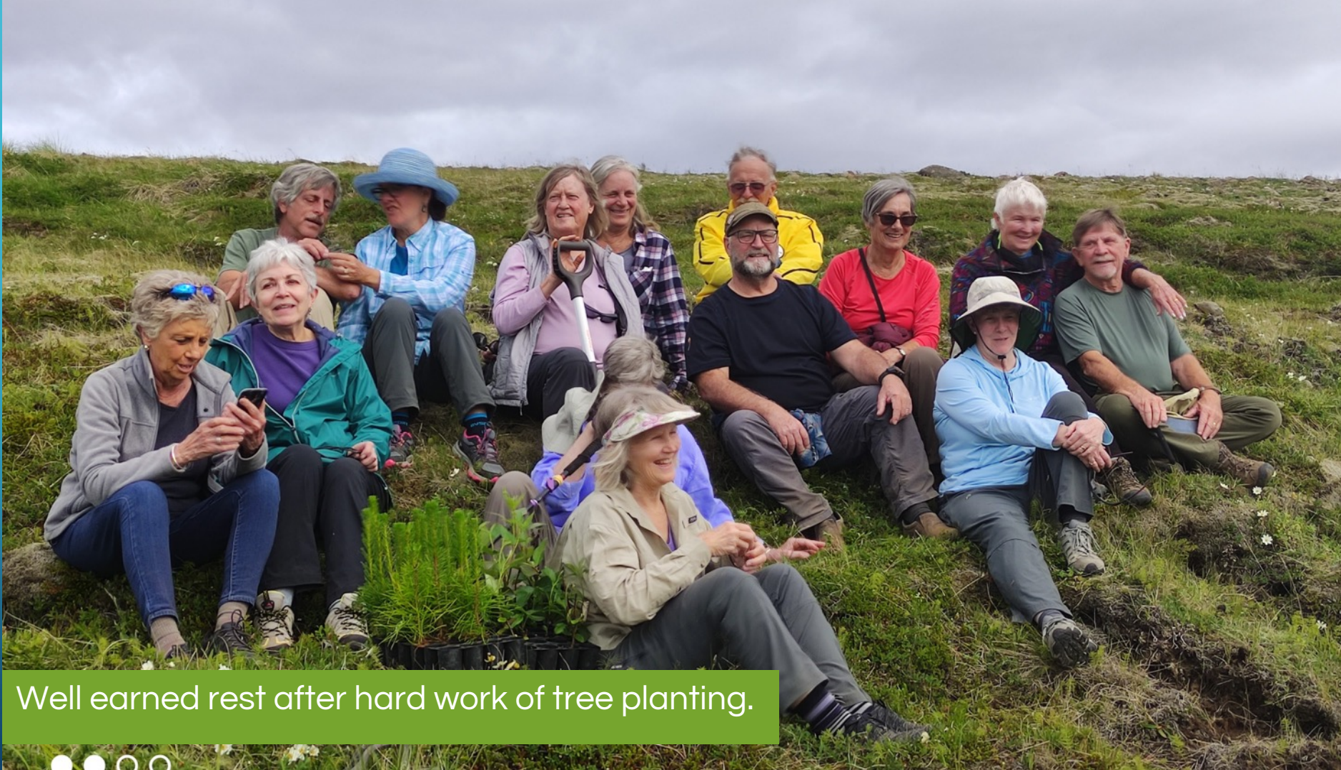
Well earned rest after hard work of tree planting.