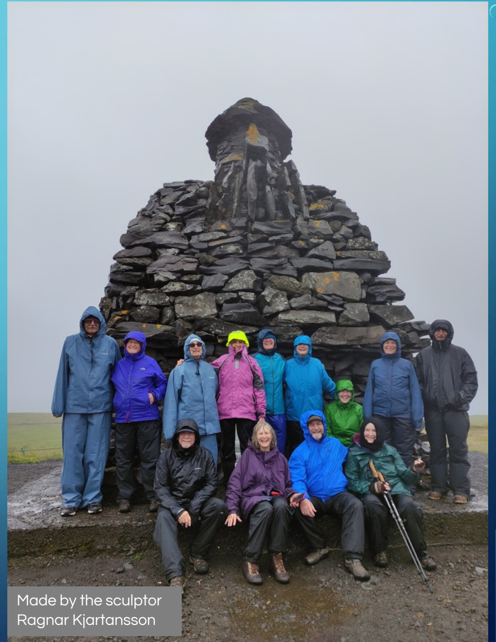
Made by the sculptor Ragnar Kjartansson