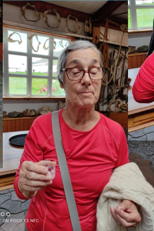
I don't like it. I don't like it ...